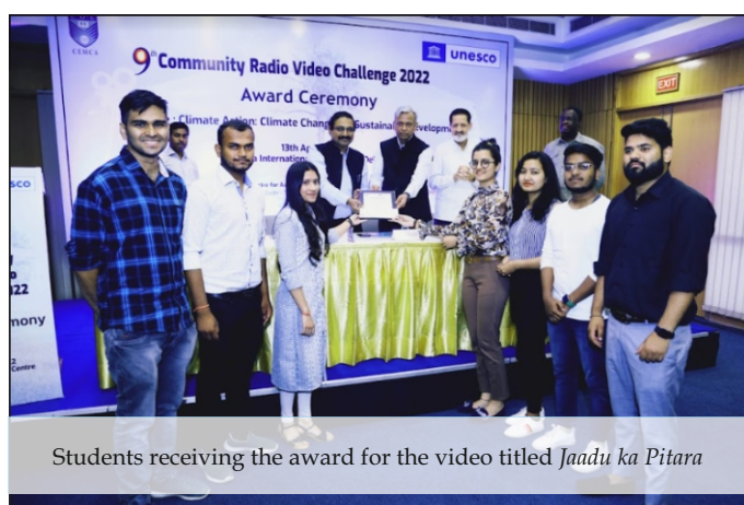
Students receiving the award for the video titled Jaadu ka Pitara