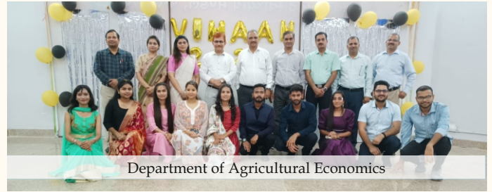
Department of Agricultural Economics