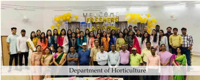
Department of Horticulture