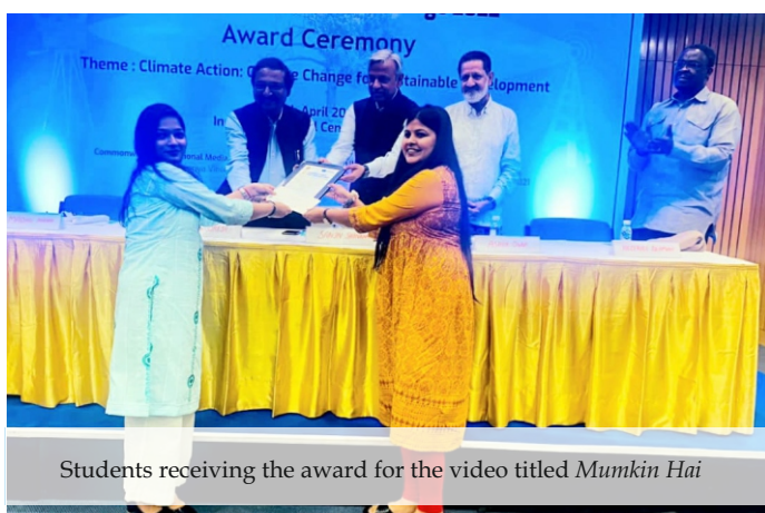
Students receiving the award for the video titled Mumkin Hai