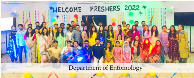
Department of Entomology

The College of Agriculture is currently running 12 Masters and 12 PhD programmes through 11 departments of the college. More than 245 Masters research scholars and more than 225 PhD research scholars are enrolled in different programmes. These research scholars are the true assets of the college and the college relishes the presence of newcomers each year. A few glimpses of the freshers celebration event of Department of Plant Pathology, Entomology, Horticulture and Agricultural Economics are shared with you all to cherish.