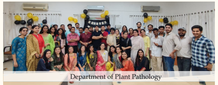
Department of Plant Pathology